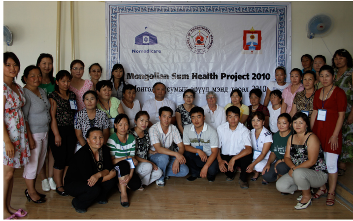
Mongolian Sum Hospital Training in South Gobi