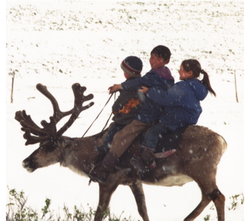
Reindeer herder children in summer snow.